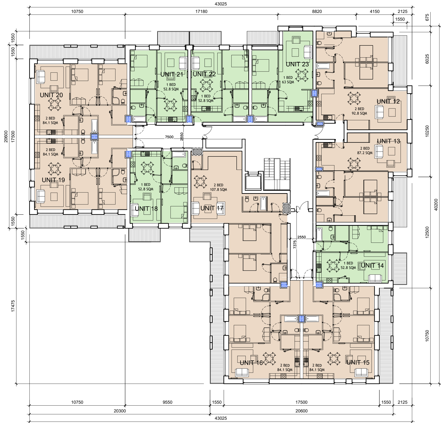
BLOCK 1 FIRST FLOOR PLAN (TYPICAL) 1:200